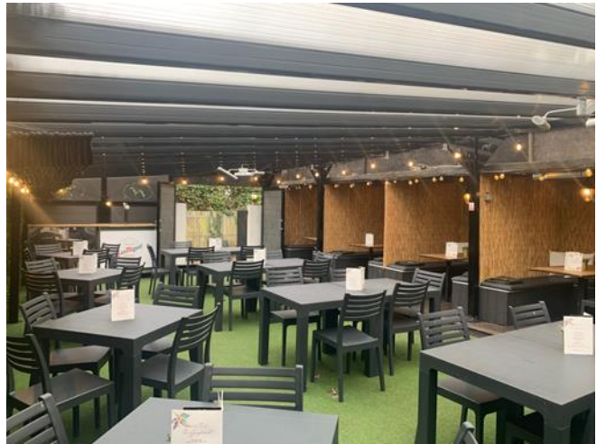
Rear patio with retractable roof