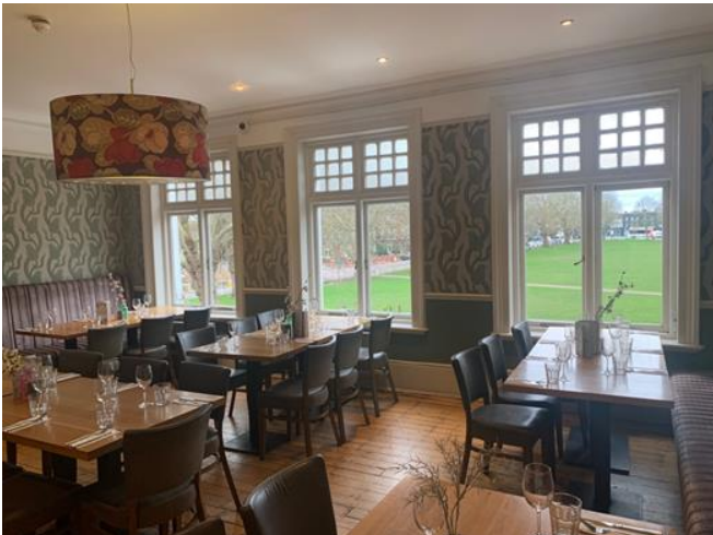
First floor dining room