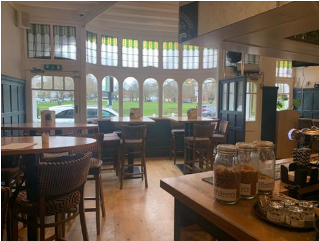
Ground floor trading area