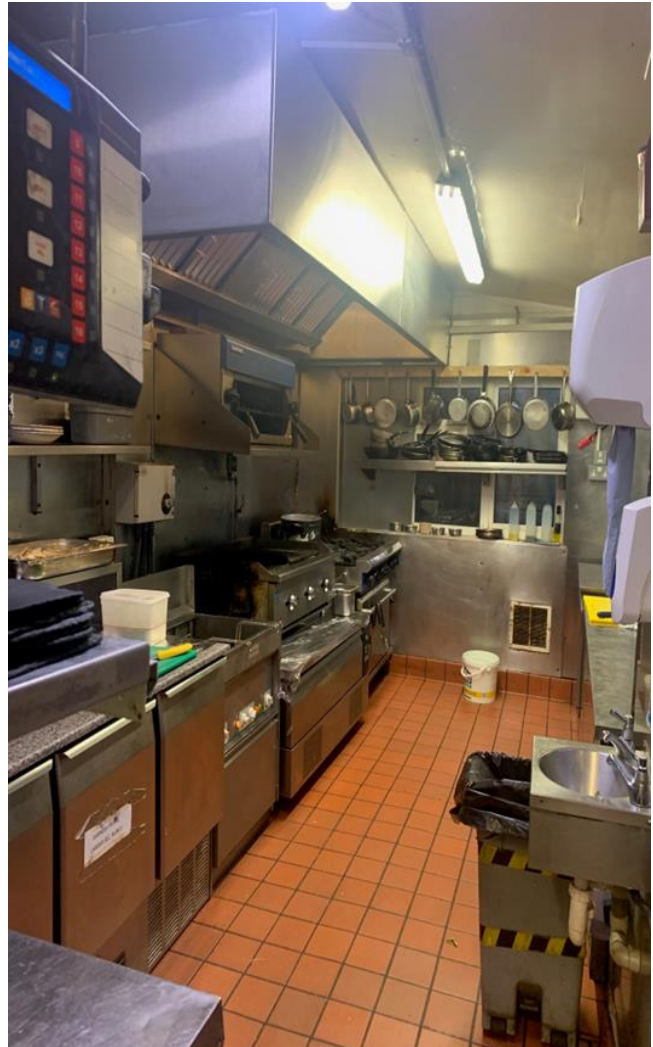
Ground floor trade kitchen