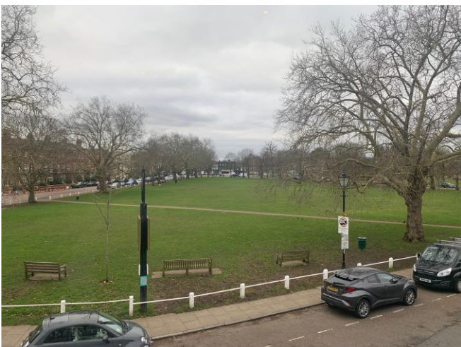
View over Kew Green from first floor dining room